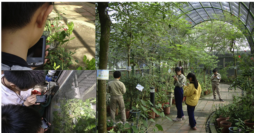
Fig. 1. Learning activity of butterfly ecology.

King (1994) used three types of questions to prompt and guide students' knowledge construction, including memory questions, comprehension questions, and connection questions. The memory questions are ones to which the answers are generally factual and can be found in textbooks, such as “How many teeth does a person have?” The comprehension questions are ones to which the answers need to be described or redefined, such as “In your own words explain the importance of A.” The connection questions refer to ones to which the answers cannot be explicitly found in the text and require inference and an interpretation of multiple concepts for a full explanation, and proof, such as “Please explain the difference between A and B.” Students are more likely to build new knowledge and understand the learning content when stimulated with the higher-level types such as comprehension and connection questions than with memory