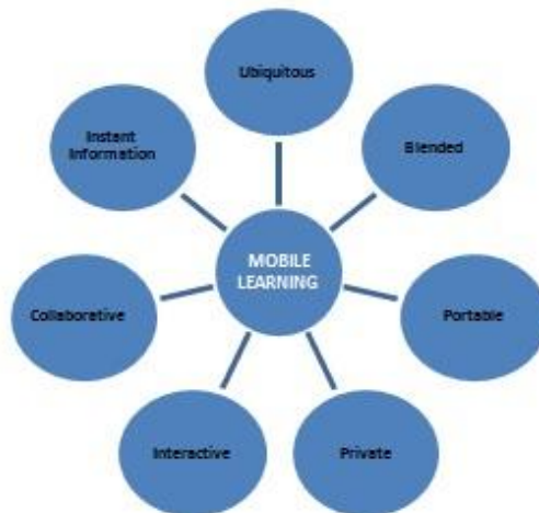
Figure 3 Basic characteristics of mobile learning

Mobile learning has different characteristics. The core characteristic of mobile learning are ubiquitous, portable size of mobile tools, blended, private, interactive, collaborative, and instant information. Seppälä and Alamäki (2003) claimed that the core characteristic of mobile learning enables learners to be in the right place at the right time, that is, to be where they are able to experience the authentic joy of learning. Figure 3 illustrated basic characteristics of an effective mobile learning approach.