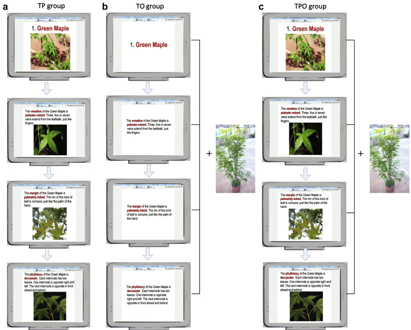
Fig. 1. The learning materials for the first plant (Green Maple) in different combinations for each condition.

The mobile device was a Tablet PC with a 12-inch monitor without keyboard (see also, Liu et al., 2009; Sung et al., 2010). To examine the impact of different combinations of media, simple Tablet device-based instructional software developed in JAVA was used in the current study. This instructional software allowed students to learn at their own pace and recorded their learning time.