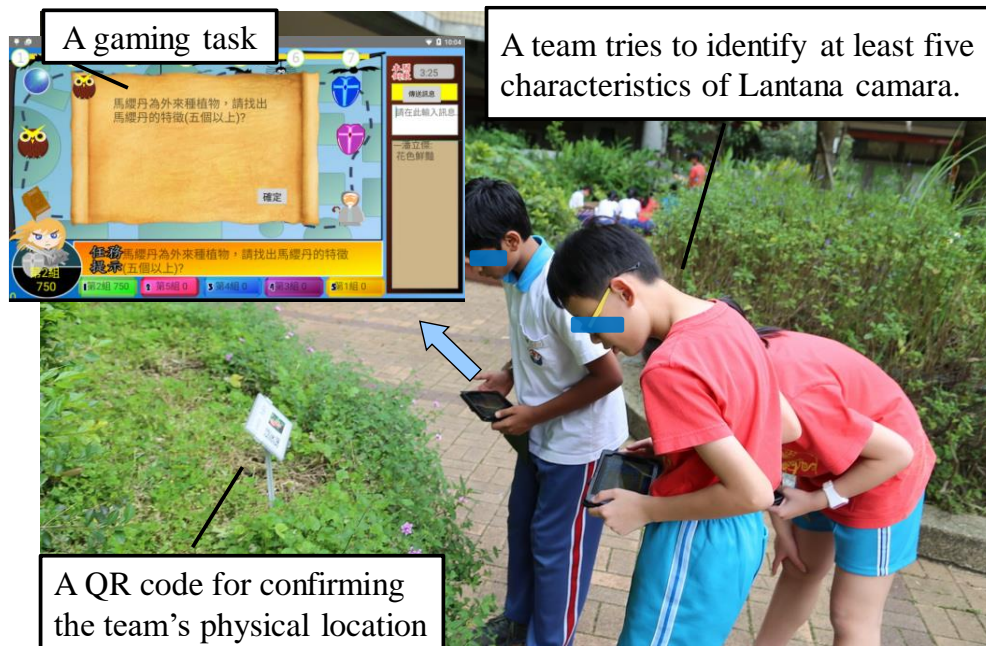
Figure 1. A learning task corresponding to the learning park

can discuss face to face or via an online chat room, which enables team members to discuss and share their findings instantly. In addition, to remind the students of the competitive status among the teams, the current top-five gaming scores of all teams are displayed on the gaming interface.