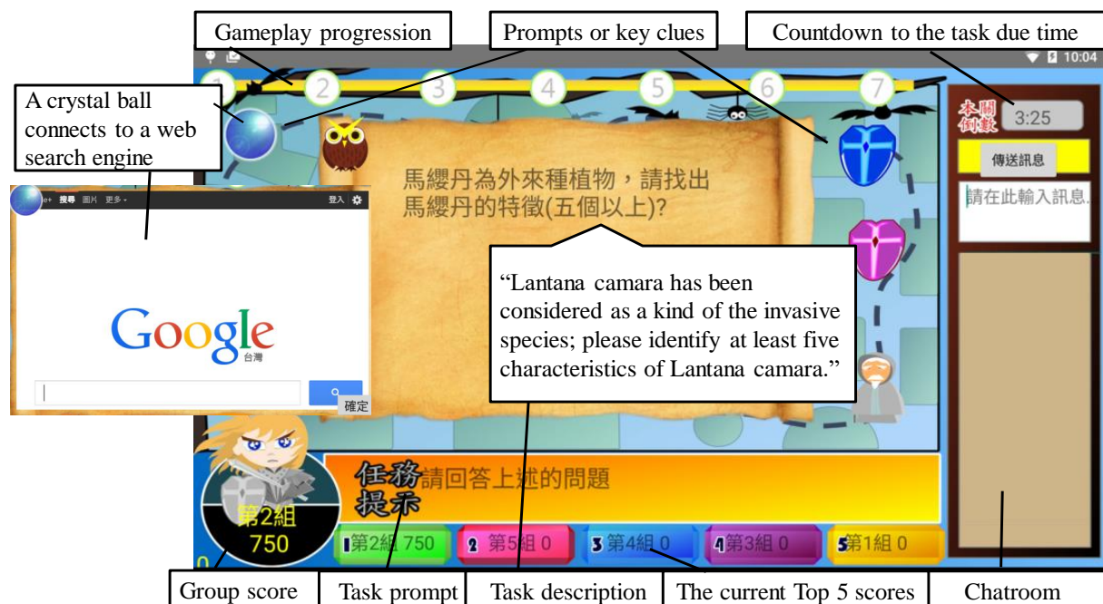
Figure 2. The main Team Competition-based gaming system interface

The learning team can collaboratively complete the task with the assistance of some tools or NPCs (Non-Player Characters) which are provided by the learning system. For example, a blue shield can provide students with the key characteristic of the creatures and environment, while a red shield prompts them to make comparisons between two kinds of creature or environment with opposite characteristics. A treasury of knowledge provides information about a creature or environment, and a sage can offer some key clues for observing a creature or environment. Moreover, a crystal ball provides the opportunity to find data by connecting to a web search engine.